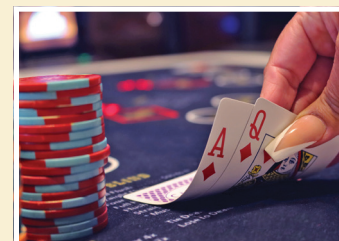
Table games abound at Cahuilla Casino and so do friendly dealers. Play your hand at Blackjack or $3 Cahuilla 21 and Ultimate Texas Hold'em table games. Service with a smile means more emphasis on interaction and satisfaction for the ultimate way to place your bets on new adventures.